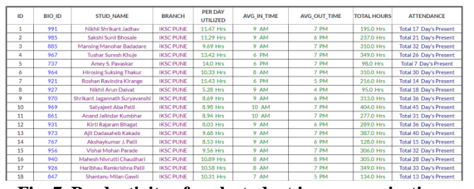
Fig. 7. Productivity of each student in an organization